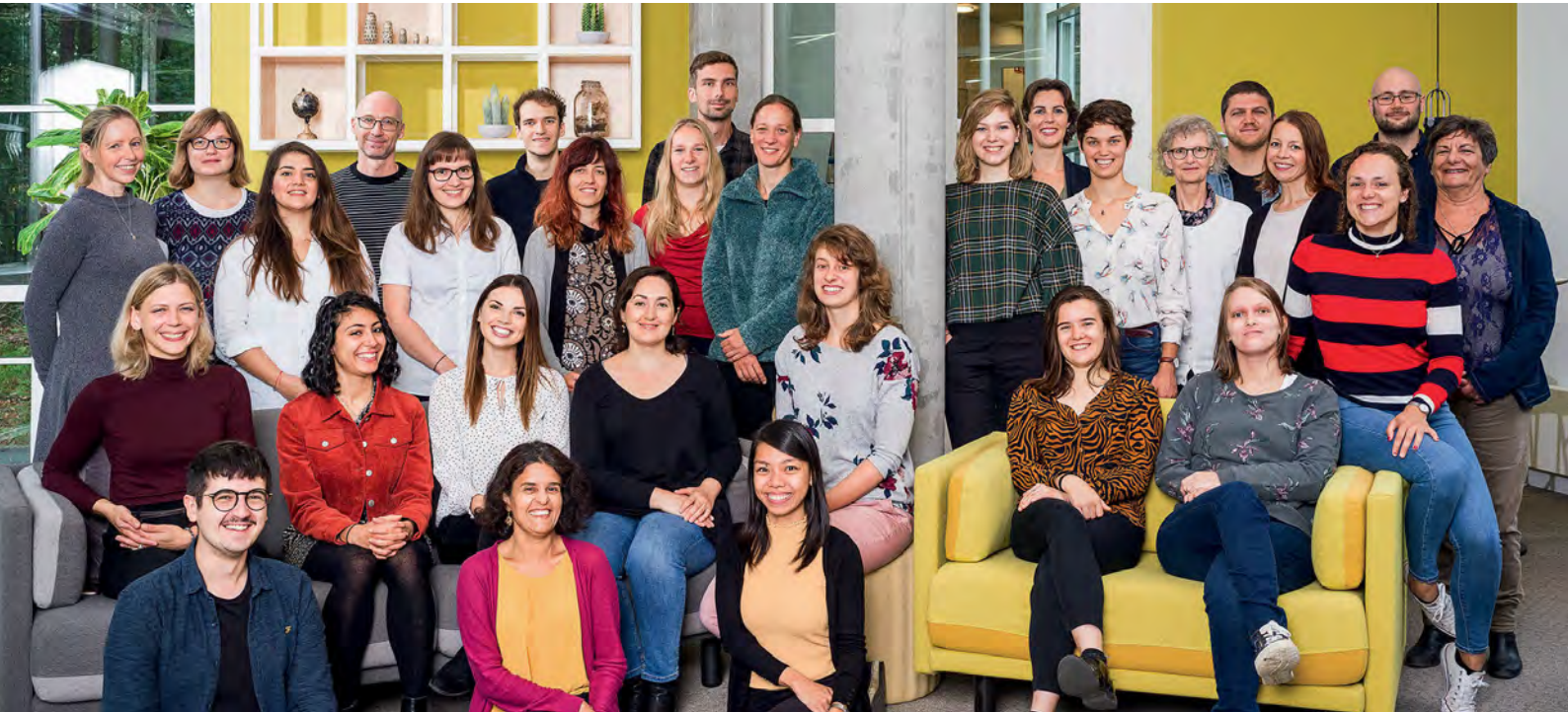
A colorful team: in the Language Development Department, researchers in the fields of developmental and cognition psychology, the neurosciences, linguistics and speech therapy work in close cooperation with experts in computer analysis and simulation.